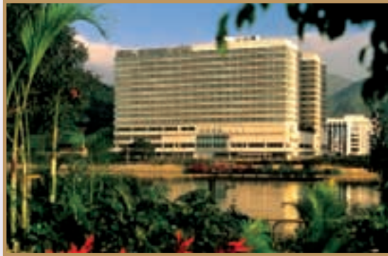
A city-resort hotel that offers a relaxing ambience. 環境清幽雅緻，恬靜怡人，乃城市中之度 假式酒店。