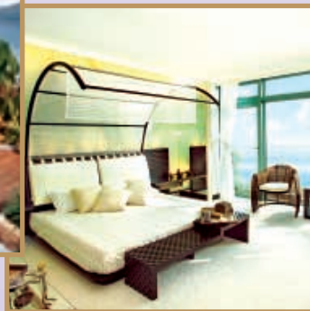
Lively Contemporary Thai styled house. 清新脫俗的時尚泰式擺設家居。