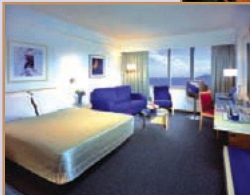
Spacious suites and guestrooms, well furnished and delicately planned. 套房及客房佈置優美，設置細意安排，空間寬敞。