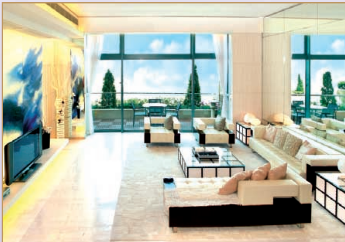
Elegant Contemporary Japanese styled house. 時尚日式設計，簡潔舒適。