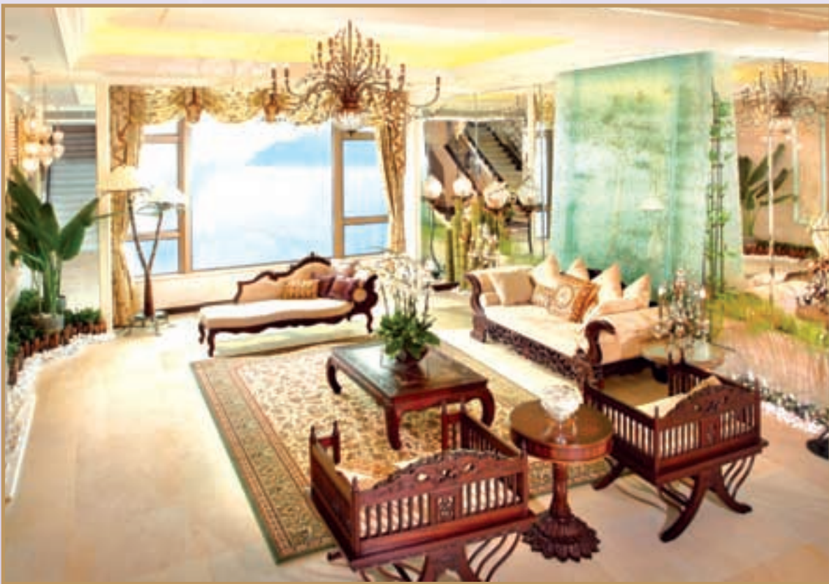
House full of Oriental Romance . 全屋充滿東方浪漫色彩。