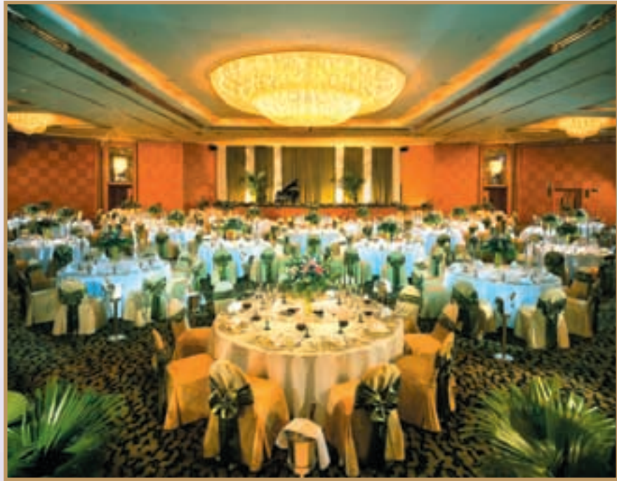
The 1,000 square meter pillarless Grand Ballroom is the largest hotel ballroom in Hong Kong. 面積達1,000平方米之無柱式大宴會廳乃香港最大型之酒店宴會廳。