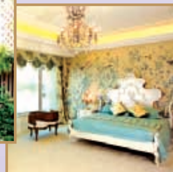
House decorated with English Country style. 英國鄉郊式之華麗佈置。